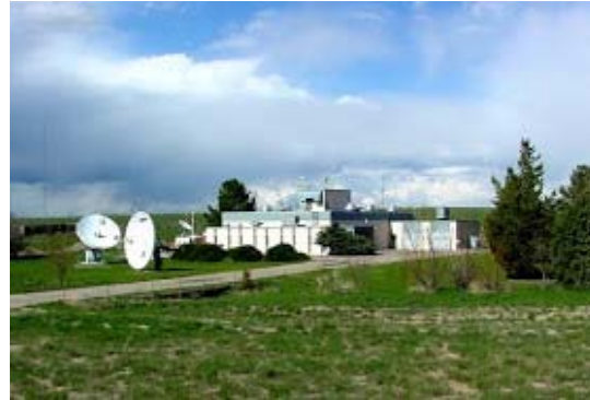
WWV transmitter site in Colorado. The NIST budget request for fiscal 2019 eliminates funding for continued operation of WWV, its Hawaiian counterpart, WWVH, and 60-kHz WWVB.

(As of now, needs over 98,000 more signatures by September 17)